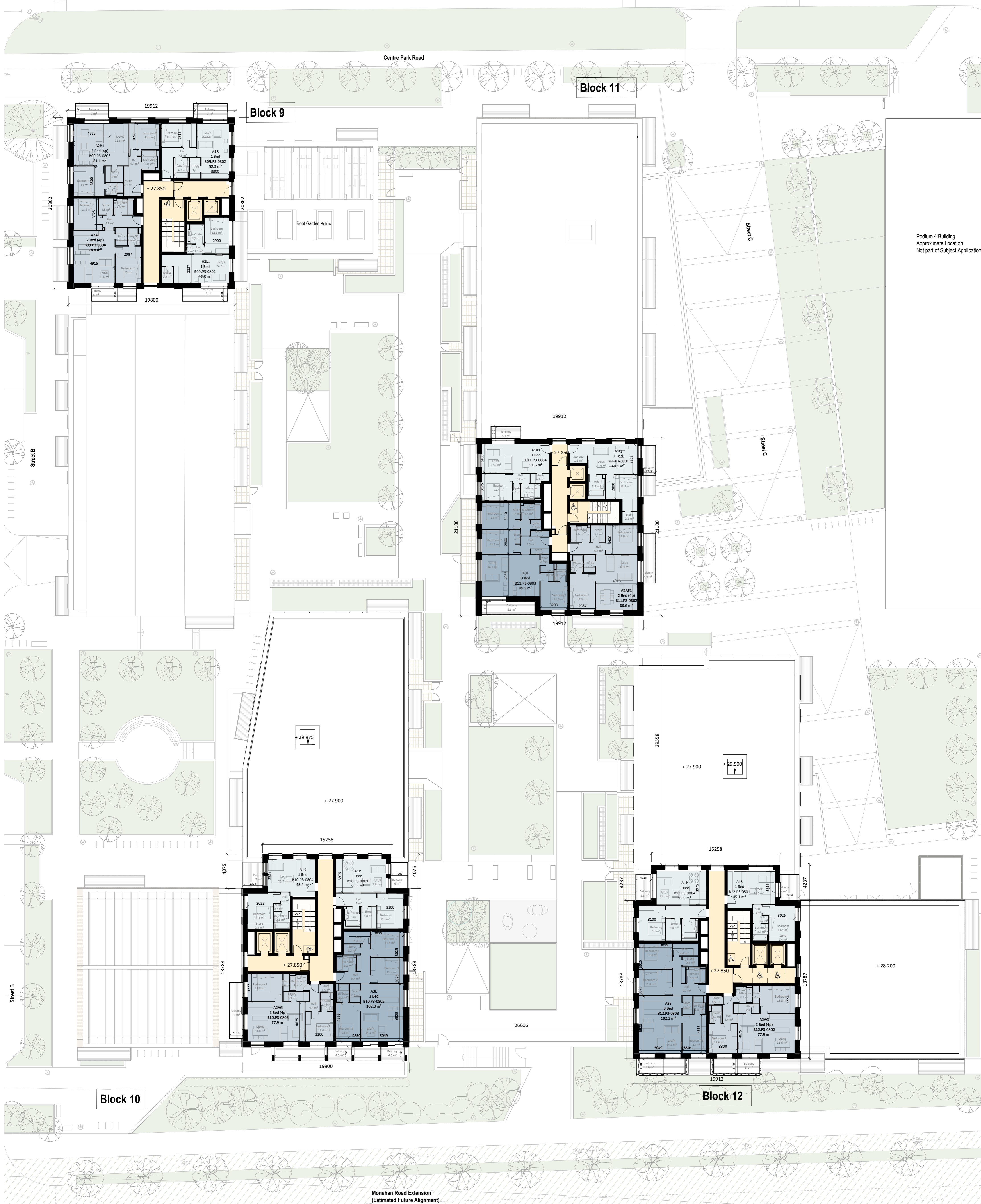
Podium 3 Level 08 Floor Plan